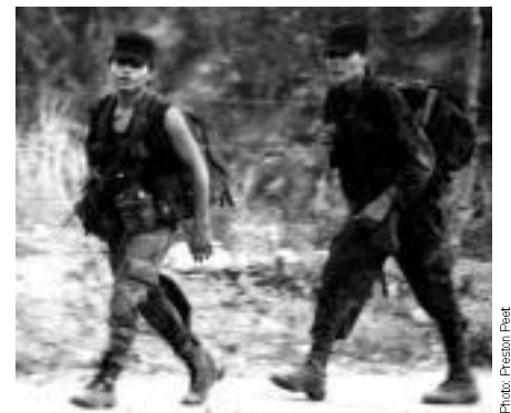
Contras in San Miguel, El Salvador, after a mission to Honduras.