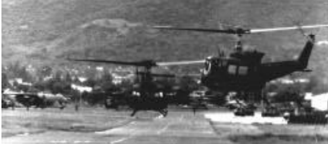
Back from Nicaragua: Contra helicopters landing at Ilopango.

US politicians continue hollering for stronger law enforcement tactics and tougher sentencing guidelines. They vote to give the Colombian military $1.3 billion dollars—so it can turn around and buy 68 Blackhawk helicopters from US arms merchants—to assist Colombia in its War on Some Drugs. The lies have a personal effect on our lives. This is not a harmless little white lie—this is costing thousands of